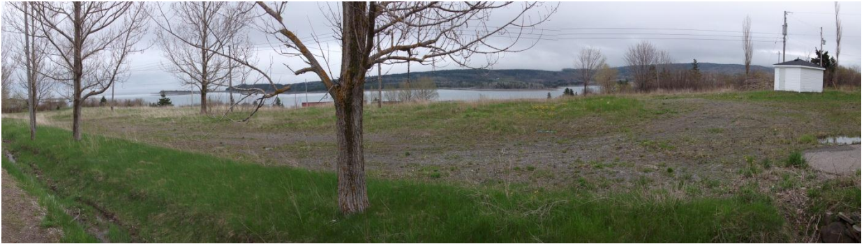
Figure 1: Panoramic view of property presently zoned as Mobile Home Park (MH-1).

intensive livestock operations, fur farms, apiaries, aviaries, kennels and outdoor tracks for the racing of animals or motor vehicles, in order to prevent conflict with residential uses.